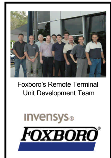
Foxboro's Remote Terminal Unit Development Team

For more on what our customers say, go to www.htsoft.com/news/testimonials.php □